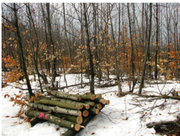
Fig. 2 Several trap trees in a pile.

burning or chipping: approximately 100 m 3 of trap trees (527 pieces) and up to 500 m 3 of standing trees in forest stands (up to 200 ha) showing C. fraxinea symptoms. At this locality, only healthy trees were left. These healthy trees are scattered over 200 ha of mixed forest and probably cover a quarter of the ground area (i.e. an equivalent number of trees to a stand of 50 ha). Infestation of trap trees was assessed by number of holes per 1 dm 2 . Approximately 50% of trap trees had 0.5–1 hole per 1 dm 2 , which was considered a strong infestation. The remaining 50% had weaker infestation, < 0.5 holes per 1 dm 2 . Thus this control method is regarded as very effective against H. fraxini .